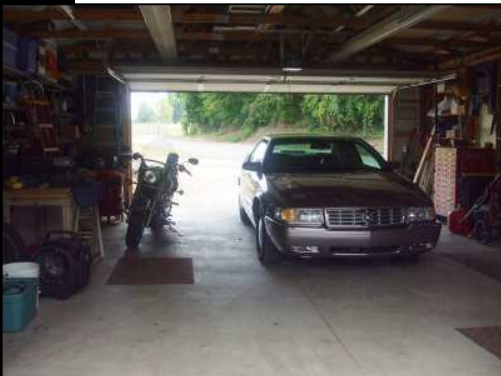
24 x 30 Detached, Insulated Garage