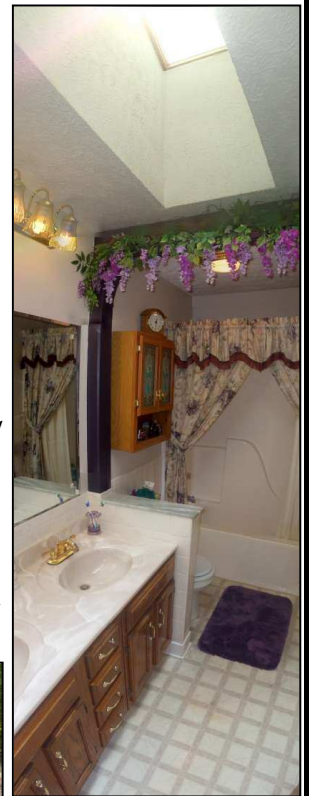
Updated Bath With Skylight