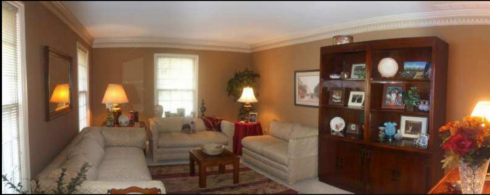
Formal Living Room