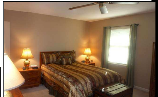
Master Bedroom with Private Bath