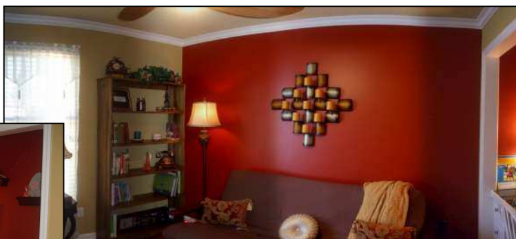
2 nd Bedroom with Office Nook